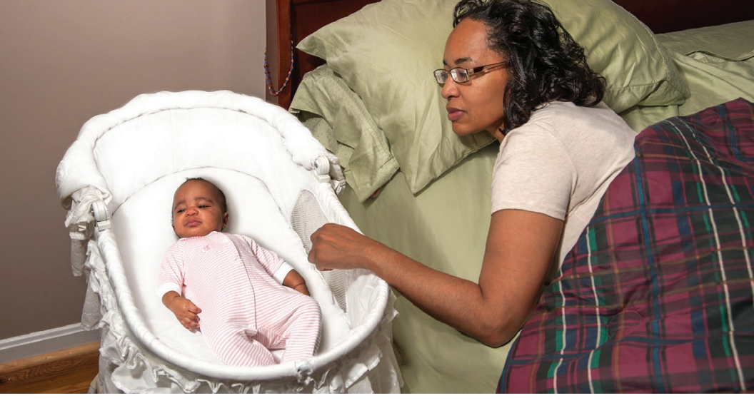
Room sharing reduces the risk for SIDS.