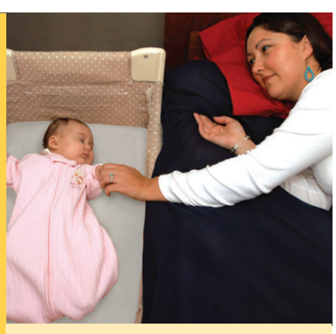
A mother room sharing with her infant.

Current evidence does not support bed sharing as a protective strategy against SIDS. On the contrary, evidence is growing that bed sharing increases the risk for SIDS and other sleep-related causes of infant death, such as accidental suffocation and entrapment, or injury.