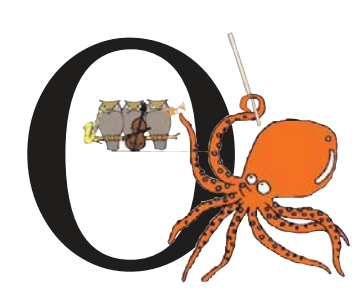
Opal the octopus organizes the owl orchestra.